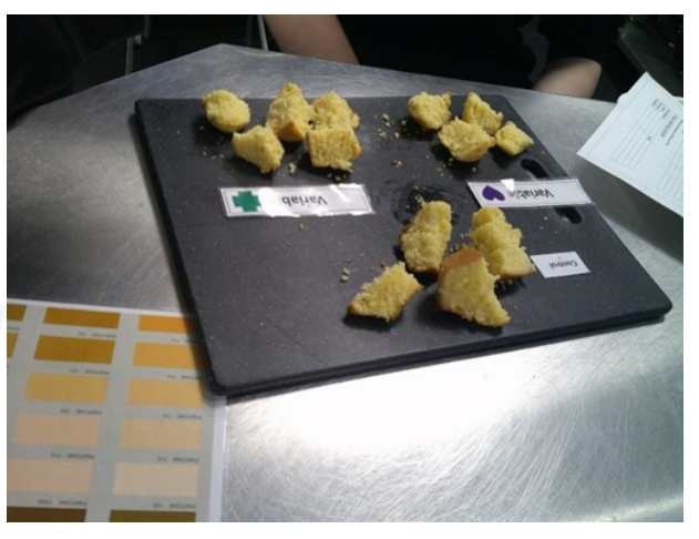
Colour Chart Comparison