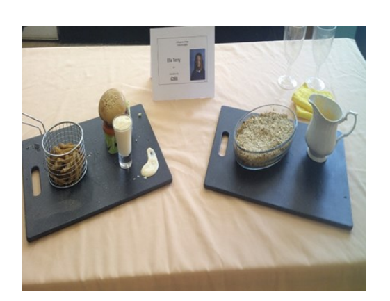
Ella Terry - Café Food